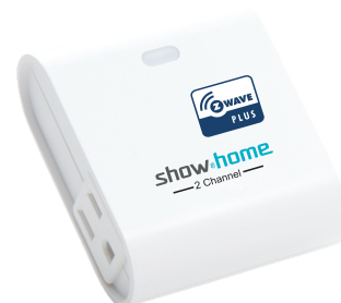
smart plug (2channel)

This warranty gives you specific rights, and you may also have other rights which vary from state to state. If the unit should prove defective within the warranty period.