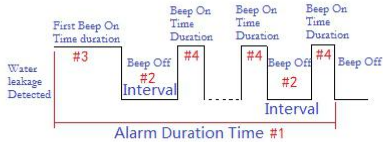
Fig.1 Alarm Time Setting Figure